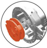
Oil Immersed Brakes