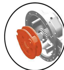
Oil Immersed Brakes