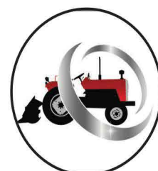
Intelli Sense Hydraulics