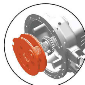
Oil Immersed Brakes